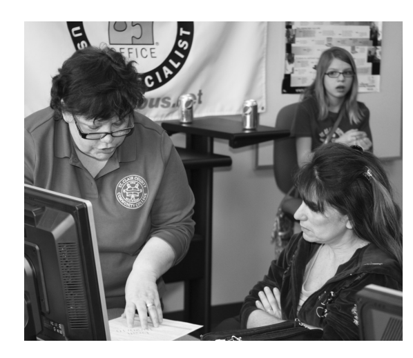
ENROLLMENT & SUPPORT SERVICES