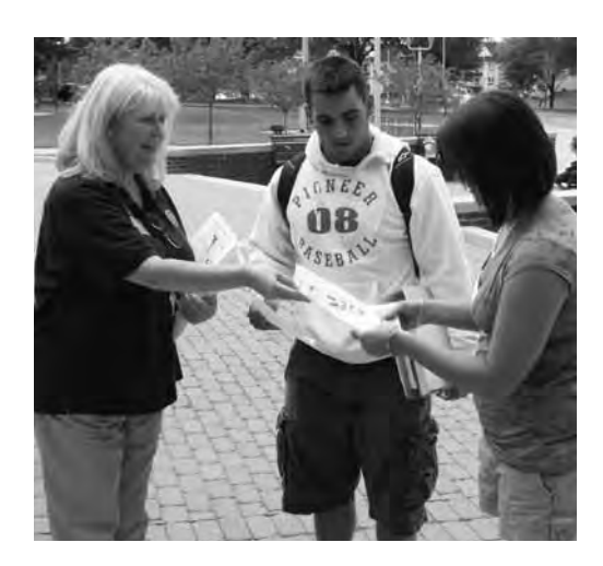
ENROLLMENT & SUPPORT SERVICES